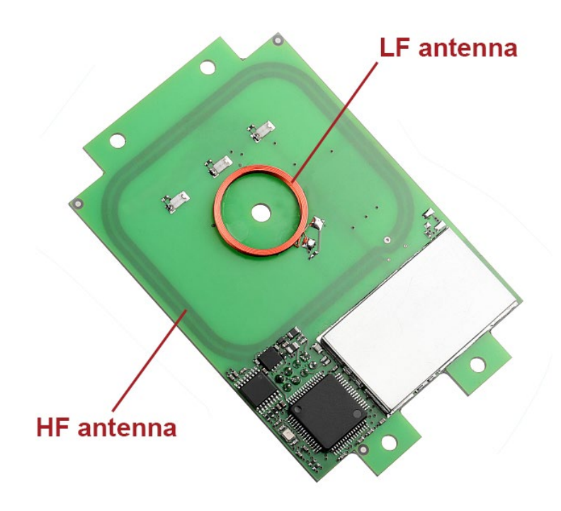
TWN4 MultiTech 2 LEGIC M LF HF (exemplary picture)

The reader module is equipped with the following antennas: